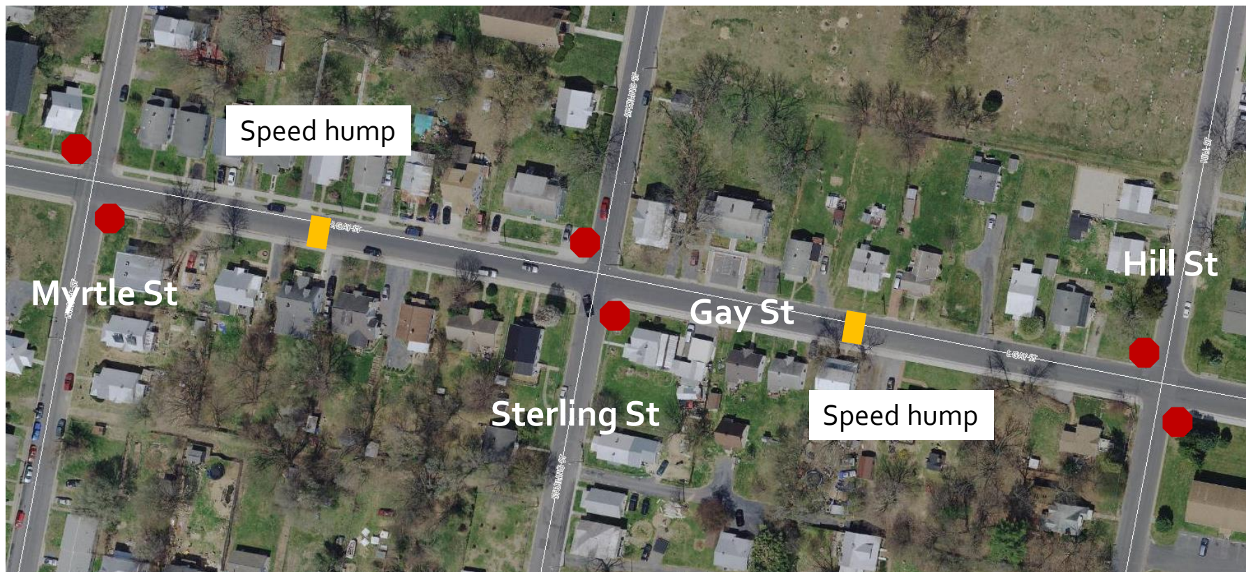
Diagram locations are approximate and not to scale

Note: speed humps are proposed due to challenges to building a raised intersection at Gay St & Sterling St