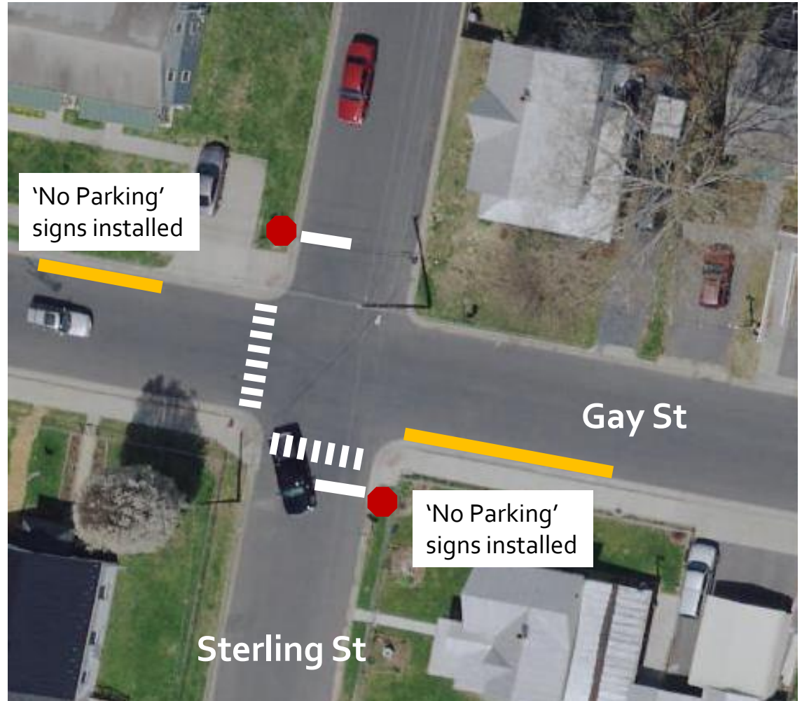
Diagram locations are approximate and not to scale