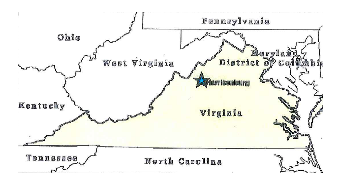
Figure 1- CITY LOCATION MAP City of Harrisonburg, Virginia

State regulations, promulgated by the Virginia Waste Management Board, require that all cities, counties, towns; or designated regions, regional planning districts, or public service authorities in the State of Virginia prepare, adopt and submit a solid waste management plan.