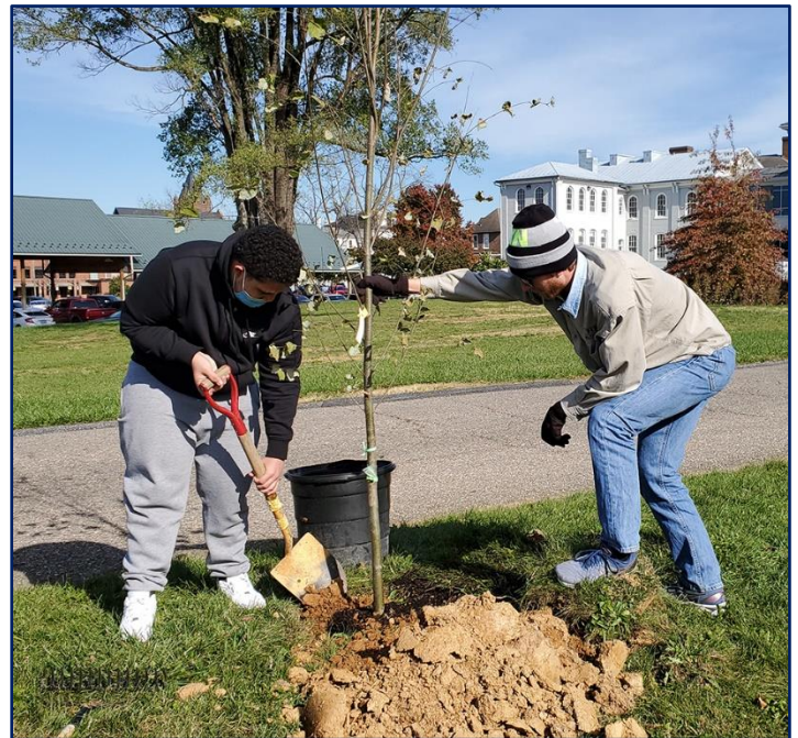
(Above) Two volunteers plant a tree outside the municipal complex in Downtown Harrisonburg. This year's event will bring more needed trees to our local canopy.

The event will start with a check in and distribution of supplies at the Lucy F. Simms Continuing Education Center parking lot, and volunteers will receive a map of the specific section in which they will be cleaning up. Participants are encouraged to stop by the Harrisonburg Public Works Green Scene, which features educational exhibits and activities about the environment. Once volunteers have received their supplies, and visited the Green Scene, they will proceed to their clean up location.