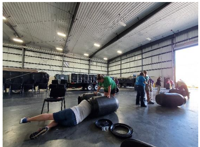
(Above) A past Rain Barrel Workshop hosted by Harrisonburg Public Works. The next event is April 19.