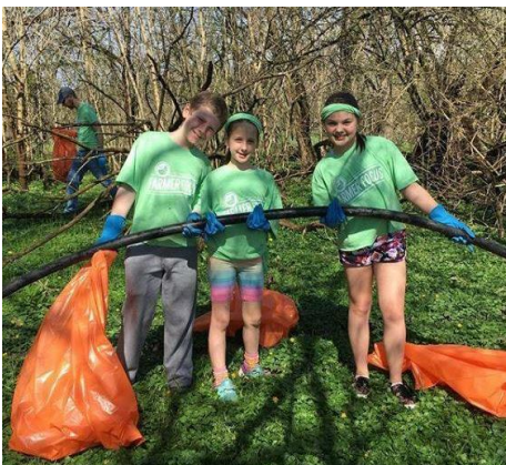
(Above) Participants at a past Blacks Run Clean Up Day event show off trash they collected.

The event will kick off with check-in, distribution of supplies and cleanup location assignments at the Green Scene – located in the grass lot beside Turner Pavilion, 228 S. Liberty St. The Green Scene will feature educational exhibits from local environmental-focused organizations and a new passport card activity that volunteers may turn in for a chance to win a prize. Once volunteers have received their supplies and visited the Green Scene they will proceed to their cleanup location.