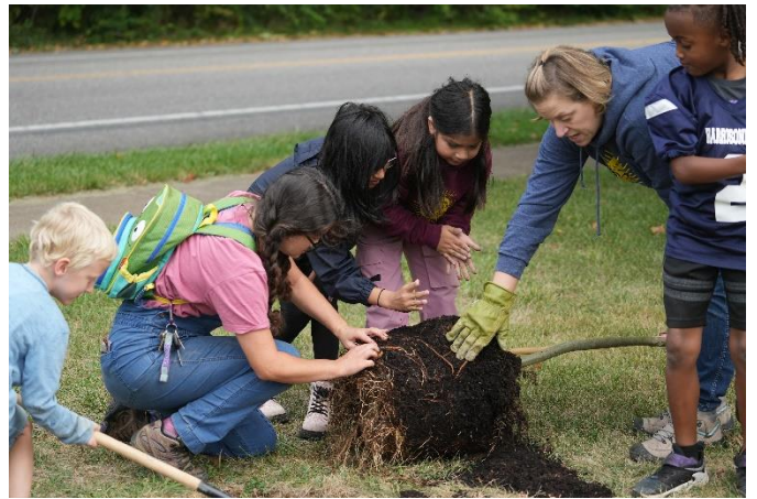
(Above) Keister Elementary School students plant a tree last year on campus.

The City of Harrisonburg is centrally located in the Shenandoah Valley of Virginia. It is home to approximately 55,900 people. More information about the City of Harrisonburg is available online at www.HarrisonburgVA.gov .