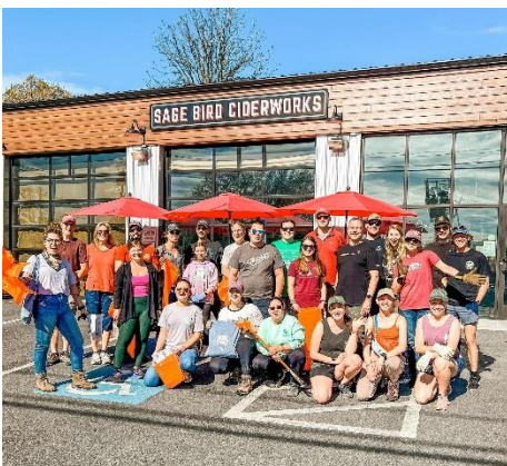
(Above) Blacks Run Clean Up Day Team organized by local business Sage Bird Ciderworks.

The event will kick off with check-in, distribution of supplies and cleanup location assignments at the Green Scene – located in the grass lot beside Turner Pavilion, 228 S. Liberty St. The Green Scene will feature educational exhibits from local environmentally focused organizations. Once volunteers have received their supplies they will proceed to their cleanup location.