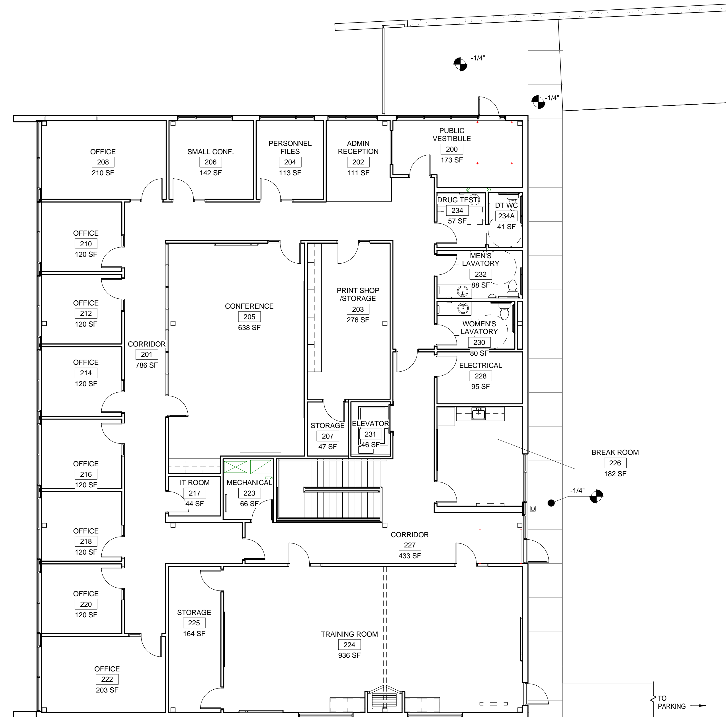
2 LEVEL 2 AREA TAKE-OFF 1/8" = 1'-0"